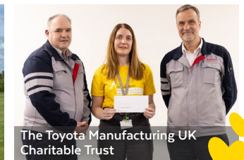
The Toyota Manufacturing UK Charitable Trust