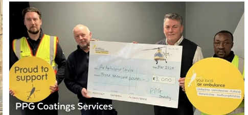
PPG Coatings Services