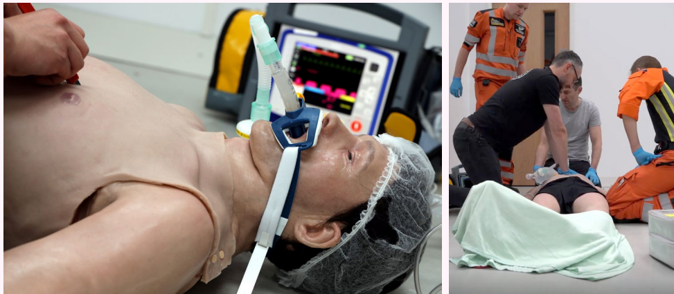
Penetrating chest trauma training (simulated stab wound to the chest) on the new Thoracotomy Manikin.