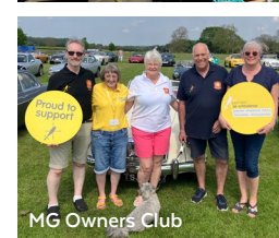
MG Owners Club