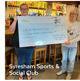
Syresham Sports & Social Club