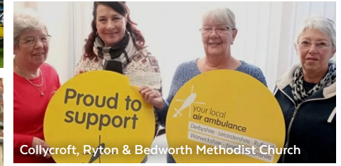
Collycroft, Ryton & Bedworth Methodist Church