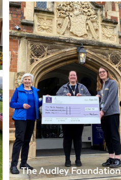
The Audley Foundation