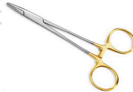
Mayo Needle Holder